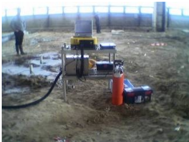
Figure 1 Contaminated ground site being measured

The DX-4030 Gas Analyzer results are displayed on a PDA via bluetooth wireless communication. No span calibrations are required and the DX-4030 is fully operational after a simple zero in clean ambient air.